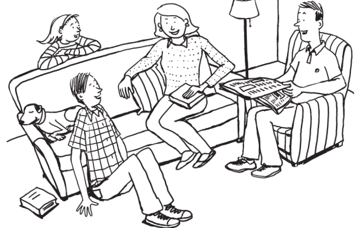
Editor's note: Guidelines are changing rapidly. Make sure to follow all local, state, and federal laws and recommendations on social distancing and other practices when using these ideas.

As a parent, you may feel overwhelmed and uncertain about what to do. Use this guide as a starting point for supporting your kids both emotionally and academically during the coronavirus pandemic.